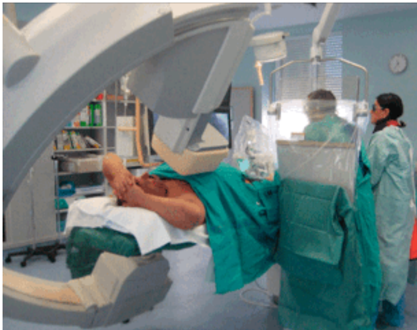
Photo: Cardiac catheterisation laboratory at the San Carlos University Hospital in Madrid

It is therefore recommended that owners, operators and ancillary staff take appropriate measures to ensure the limitation of this exposure by applying the above recommendations.